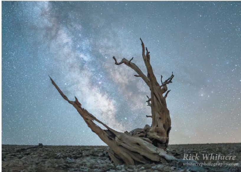
Cradled in My Arms by Rick Whitacre

The Town of Los Gatos and the New Museum of Los Gatos Present