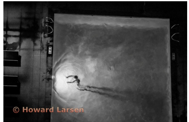
Pool Howard Larsen

It was done with a Nikon D810, Nikon 70-200 zoom at 200mm, 1/200 sec, f4, ISO 500