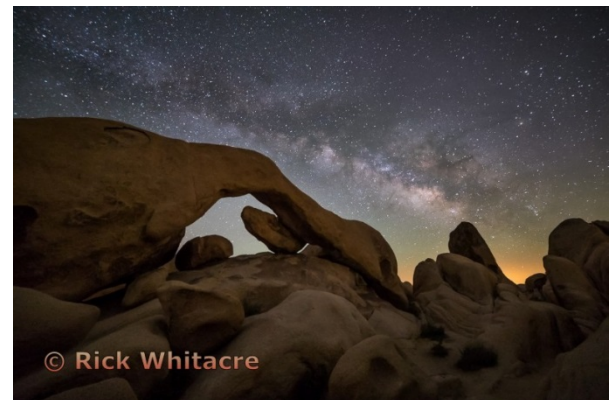
Arch Rock Milky Way

The first composition I shot was a 6 panel panorama that you will see next month. This image was the last one I took that evening on my way back to bed. Even though the earlier panorama was the shot I was going for, I ended up liking this "grab shot" better and entered it first.