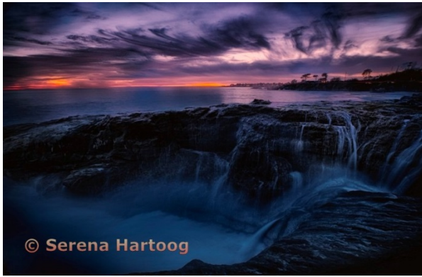
An Ocean Chasm Serena Hartoog

I have not shot landscape for a while. I had a photography talk April 11th about landscape and HDR so it focused me to go take landscape images again.