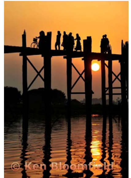
Villagers Cross U Bein Bridge at Sunset, Mandalay, Burma Ken Bloomfield

Shot at f7.1 at 125th second, focal length of 105 mm. Except for a little cropping to straighten the image and minimal saturation, this was the exposure right out of the camera.