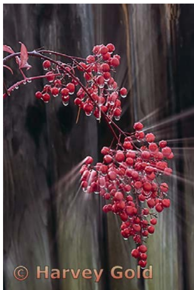
Radiating Raindrops Harvey Gold

The picture was taken during the current rains. Nandina plants are plentiful in my backyard and their red berries capture raindrops easily. I shot this at 1/60 of second at f/5.6. The image was processed in Photoshop using a plugin to enhance the rays.