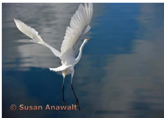
Hallelujah! Egret Rises on Waters of Percolation Pond in Campbell After the Rains

I have taken many shots of egrets in Vasona and at the percolation ponds. With the drought their presence became scarce. Fish as a source of food had literally dried up. With the rains the egrets came back. Watching these stunning, large white birds, you will notice they are waders and are always on the edge of the water. After the last great storms in late January this year, I walked around the percolation ponds in Campbell. At the edge, among some tall yellow grasses, was an egret on the prowl. As I approached on a bank above him, I clicked my camera. He straightened up, stared at me. Torqueing his elegant neck around to reconnoiter a safe pathway of escape, he then took a few cautious steps away. I clicked. He stiffened. He tensed even more. Then he was off over the reflected sky-blue clouded waters below me. I clicked again. The wings were vertical instead of horizontal, a first for me. The colors of the sky and clouds reflected in the water, his whiteness, made me think of Handel's Hallelujah/Messiah. Water was back on our land and the egret was soaring. ISO 400, lens 105mm, f/6.3, Shutter speed 1/600 sec.