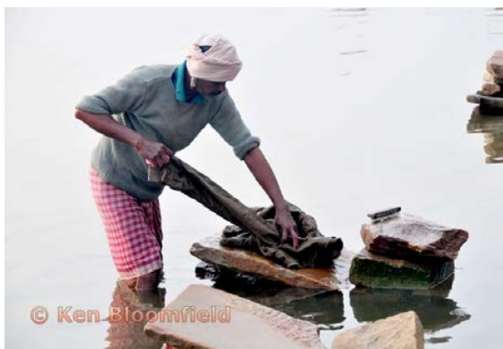
Laundryman in the Ganges River, Varanasi, India Ken Bloomfield

On a recent trip to India, we stayed in Varanasi for two days and had the opportunity to take a boat ride on the sacred Ganges River to observe the early morning rituals and activities of the local people. The sights were amazing and unforgettable, as we witnessed everything from people praying in the river, washing in the river, sitting in the river talking, urinating into the river, performing cremations, and doing laundry in the river. As shown in the image, groups of men stand in the shallow river and beat the laundry against the flat rock, stopping periodically to soap and scrub the material, knead it, dip it into the river to rinse it, and then start the process over again. The sound of the slapping against the rock echoes off the sloped cement river banks where they lay the "clean" laundry to dry in the sun. We were also surprised to see dozens of white bed sheets from local hotels laid out to dry on the river bank! Nikon D300, Nikkor 18-200mm lens at 112mm, f5.6, 1/100 sec, +.7 comp.