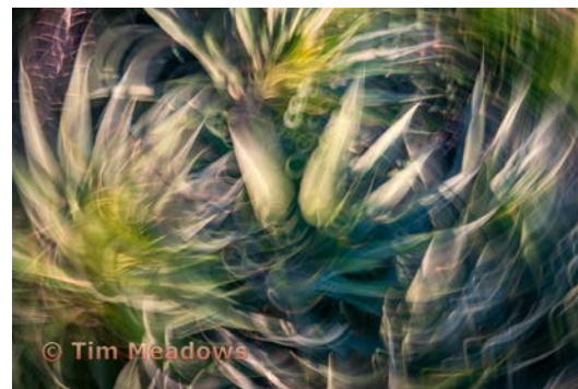
Garden Dreamscape Tim Meadows

This image is a perfect example of the unexpected things that can come from a photo outing. I got up early one morning to shoot the sunrise over Capitola wharf, but it didn't materialize the way I'd hoped. Walking back to the car I noticed a nice pattern of foliage so I decided to play with motion blur. To make this image, I rotated the camera while pressing the shutter release. This technique works best with a slightly long shutter speed of, say 1/8 sec. The resulting image was enhanced in Lightroom, primarily to adjust the color palette to be more Chagall-ian and dreamlike. Nikon D810, 24-70mm f/2.8 lens at 62mm, ISO 125, f/16, 1/8 sec.