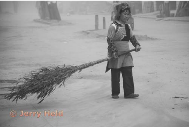
Street Sweeper in Dusty Yunan, China Jerry Held

I was with a small group in Yunan, China where we were on our way to shoot the thousands of rice paddies. We stopped for a noodle breakfast in a dusty little town. As we were eating, I looked out the window and saw a number of ladies trying (in vain) to sweep the streets with their homemade brooms. I ran outside and was able to get a few good images before they moved on. Given the bleak and dusty nature of the town, I felt the image was best developed in B/W. The rice paddies were beautiful but capturing the emotion of the local people always seems to produce my best images.