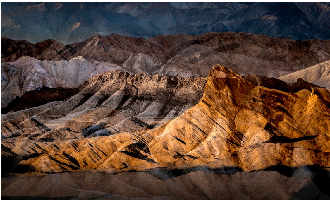
Zabriski Dream, Susan Dinga, Creative Projected ▶

The Eastern Sierra is such a stark but beautiful environment that it invites photographers. In 2015 I took a drive up 395 stopping at various scenic places. The Manzanar Camp still has some of the original barracks where Japanese Americans were housed during their internment in WWII. Juxtaposing the housing with the harsh environment struck me as a powerful comment on past injustice. Nikon D800E, 24-120 lens @ 92mm, various adjustments to fix exposure, etc.