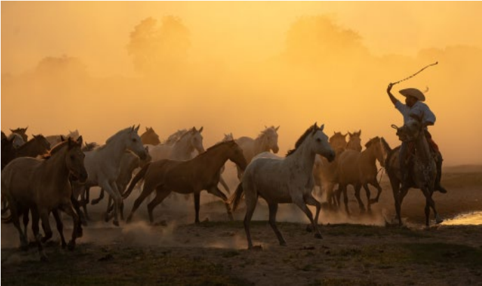
Andele!, Mercury Freedom, Color Projected