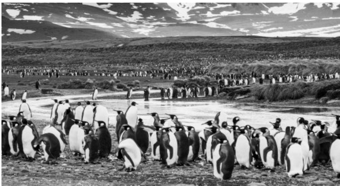
Penguins Galore - South Georgia Islands, Alan Levenson, Monochrome- Projected ▲

Contrary to the title of this image, I did not take it in Morocco. Rather I took it in a local pool with a model as my princess. This was an experiment for me since it was a major departure from what I normally shoot and I definitely stepped out of my comfort zone. I used my Sony A7r3 with a 24-70 lens at 70mm. 1/500, f11, ISO 100.