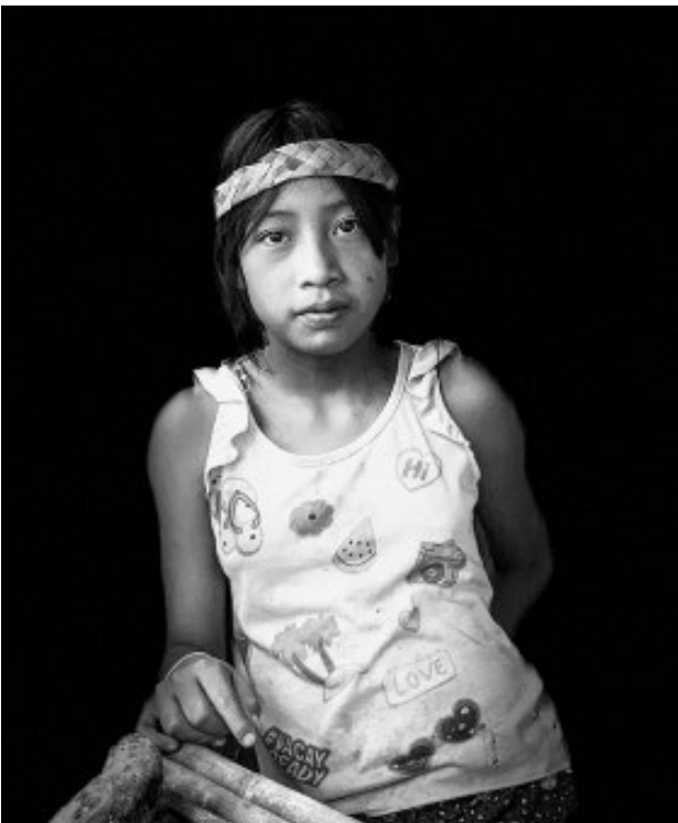
Indigenous Girl, Guarani, Argentina, Monochrome Projected