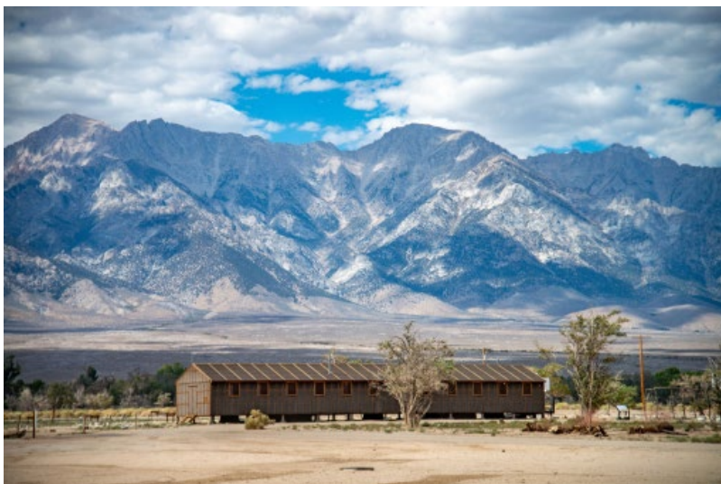
◀ Barracks Housing at Manzanar Internment Camp in Eastern Sierras, Bob Downs, Journalism Projected

The Eastern Sierra is such a stark but beautiful environment that it invites photographers. In 2015 I took a drive up 395 stopping at various scenic places. The Manzanar Camp still has some of the original barracks where Japanese Americans were housed during their internment in WWII. Juxtaposing the housing with the harsh environment struck me as a powerful comment on past injustice. Nikon D800E, 24-120 lens @ 92mm, various adjustments to fix exposure, etc.