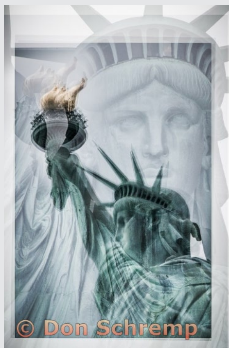
Previous creative image winner

7:30 p.m. See deadlines and more info on the website