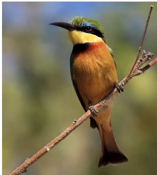
African Bee-eater

On May 18 we gathered virtually to review nearly 40 images submitted by members for a detailed critique.