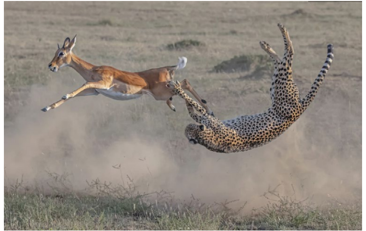
Jeffrey Wu, from Toronto, Canada, captured the animal fight in the Masai Mara National Reserve, in Kenya

Entire article here - https://www.theatlantic.com/photo/2020/05/winners-2020-bigpicture-natural-world-photography-competition/611491/