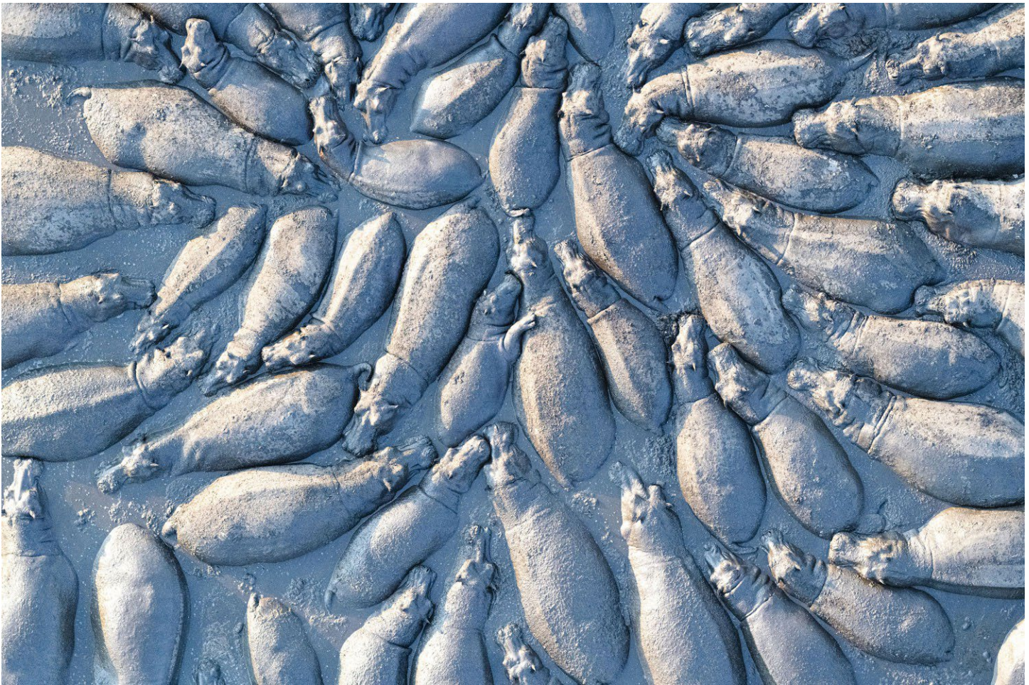
Hippo huddle: Terrestrial Wildlife Finalist - Talib Almarri