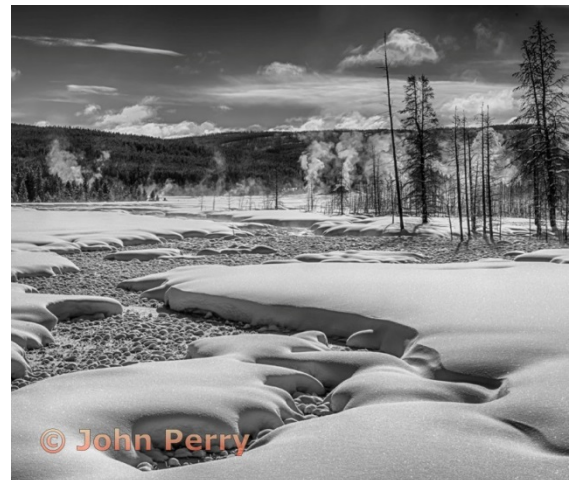
Winter Sunrise in Yellowstone NP John Perry

For this photo I used my Nikon D800E and 24-70mm f/2.8 lens on a tripod. All the images from this workshop were shutter speed bracketed +1, 0, -1 at f/11. The reason for the bracketing was to guarantee at least one correct exposure; also I could create an HDR if need be. I processed the image in LightRoom 5 and then converted it to B&W using Silver Efex Pro 2.