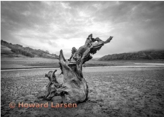
Creature Howard Larsen

This was done last year inside Uvas Reservoir (near Morgan Hill) when the water level was very low. It got down to 2% at one point. Today Uvas is at 70%, so this area might be under water now.