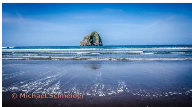
Haystack Rock - Oregon Coast