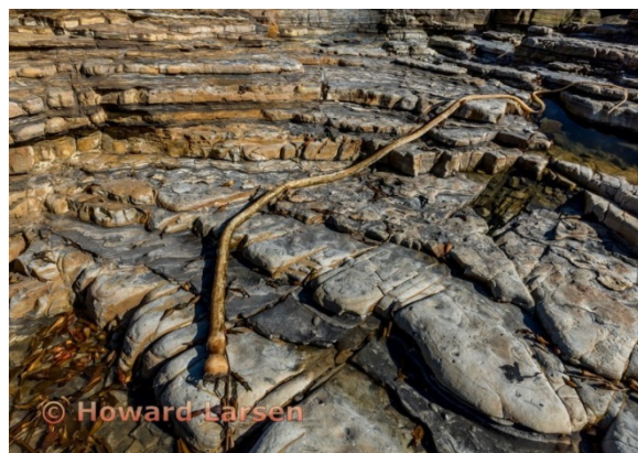
Earth detail Howard Larsen

Equipment: Nikon D810, 24-70 zoom at 24mm, 1/200 sec, f22, ISO 640