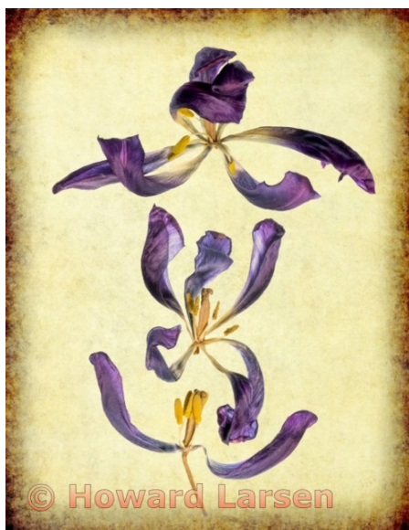
Toulipgraphy Howard Larsen

Toulipgraphy - the ancient art of drawing with tulips (like calligraphy but with tulips). This is a subcategory of a larger series called Florapoesis.