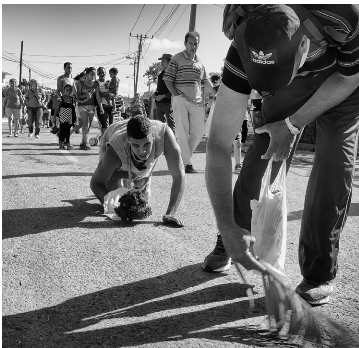
2021 Journalism Projected by Mila Bird

Special Interest Group - Bird Photography