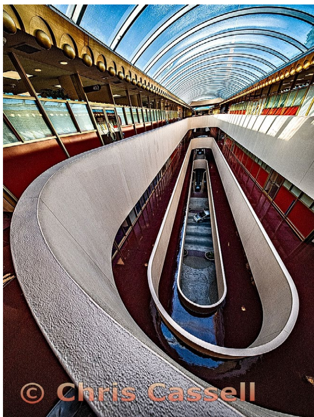
◀ Wide-Angle View of Marin County Civic Center, designed by Frank Lloyd Wright, Color Projected