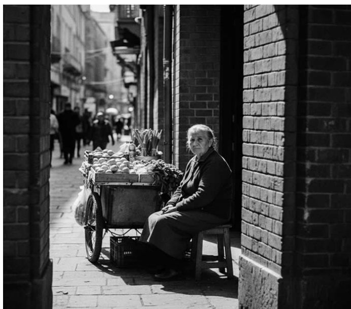
Photo: AI Image/Google Gemini, Prompt: Gritty Street Photo Texture

The truth? The magic of AI art isn't in the platform; it's in the prompt. And when you talk about black and white, you're tapping into something primal. You're leaving the distraction of color behind to focus on pure soul: the texture, the shadow, the emotion. Think classic Hollywood—the moody cinematography of a noir film, the timeless gaze of an Ansel Adams shot. That's the energy we're chasing.