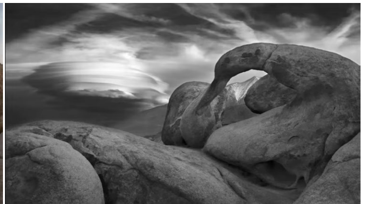
Color before ..... Monochrome after