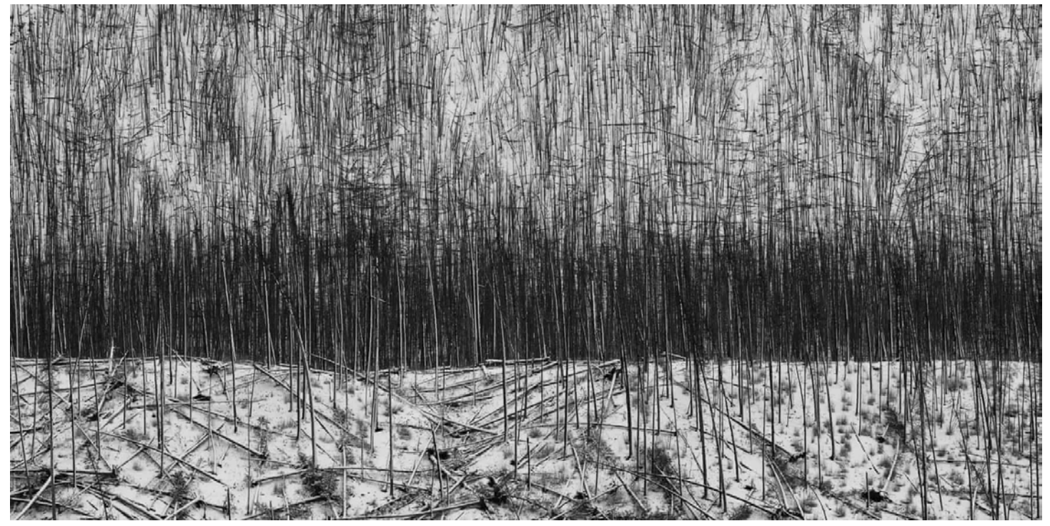
Mel Sinclair: Pick up sticks

In black and white : the 2021 Mono photography awards Dedicated to the art of monochrome and black-and-white photography in Australia and New Zealand, the Mono awards has announced its winners across three categories: people, places and animals. More at <a href="https://www.theguardian.com/artanddesign/gallery/2021/aug/25/in-black-and-white-the-2021-mono-photography-awards-in-pictures">https://www.theguardian.com/artanddesign/gallery/2021/aug/25/in-black-and-white-the-2021-mono-photography-awards-in-pictures</a>