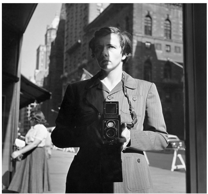
Self Portrait, New York, 1953 © Estate of Vivian Maier

More at <a href="https://petapixel.com/2021/07/27/no-one-needs-to-see-your-photography/">https://petapixel.com/2021/07/27/no-one-needs-to-see-your-photography/</a>