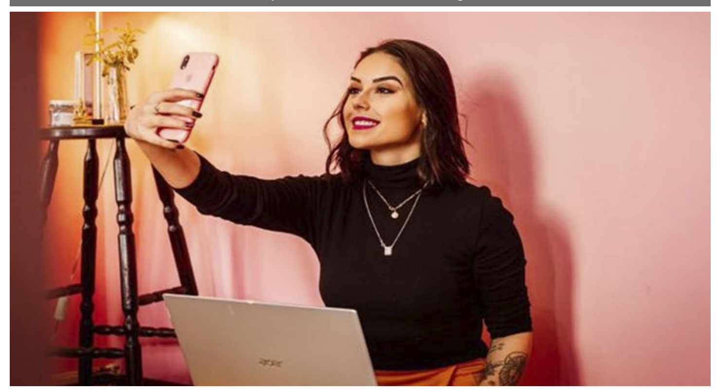
What Is Norway's New Photo Retouching Law? By Sampada Ghimire, makeuseof.com

Communication and keeping in touch with our friends and family have become convenient thanks to social media. However, social media has drawn many negative impacts on our lives. The internet is full of models exhibiting their flawless and unrealistic bodies, which can exacerbate body insecurities. In an attempt to mitigate these unrealistic beauty standards, Norway has passed a law requiring influencers and advertisers to label their retouched photos. We're going to be taking a look at what that law is, and how it affects you.