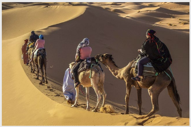
Previous winning Travel image by Uwe Schmalembach

Mon. September 13th, Competition - Travel/PJ 7:30 p.m. See deadlines and more info on the website