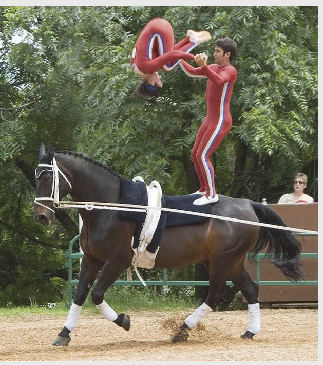
Previous winning PhotoJournalism by Harvey Gold

Meeting September 13th to be virtual Login to the website home page for zoom link