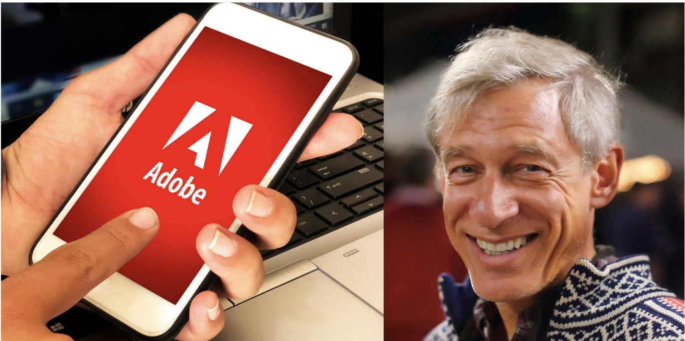
App to concentrate on computational photography