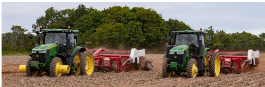
◀ Mechanical Potato Harvesting on Prince Edward Island: Tractors pulling halum toppers to separate the potatoes from the stalks September 2022. Sequence, Airdrie Kincaid, Photojournalism

When we visited Prince Edward Island in September 2021 to view lighthouses, we saw lots of potato fields and learned that potatoes are the primary cash crop on the island. An acre can apparently yield between 24,500 and 61,000 pounds. We drove past a field being harvested and pulled over to watch the process. The equipment was colorful and there was lots of action as an amazing number of potatoes were harvested from each row. As the tractors went back and forth across the field, I photographed the two major steps in the process.