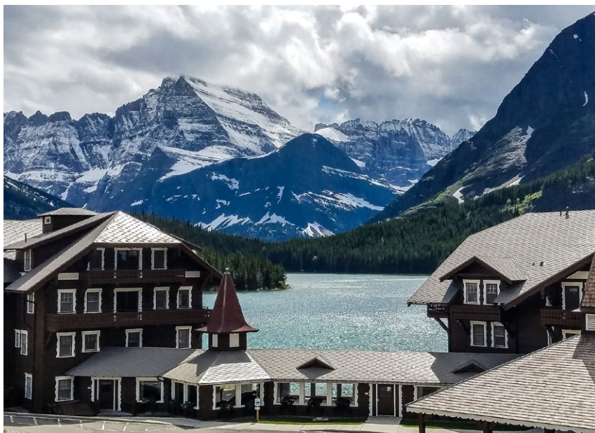
On left, Wallstreet at Zion National Park and above a Lodge in Montana.